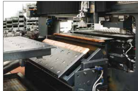
Small part unloading system