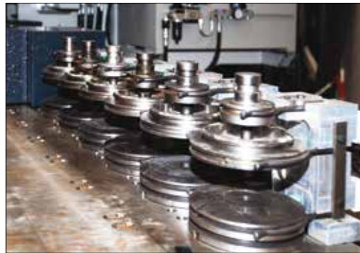
Automatic punch tool changer