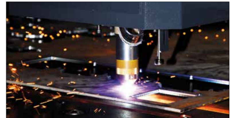
Plasma cutting unit