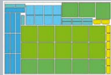
Automatic nesting through dedicated software

This system is equipped with the new Hypertherm XPR170 plasma torch which enables the sophisticated FICEP system to control the torch height and cutting parameters to ensure the maximum performance of the cutting process.