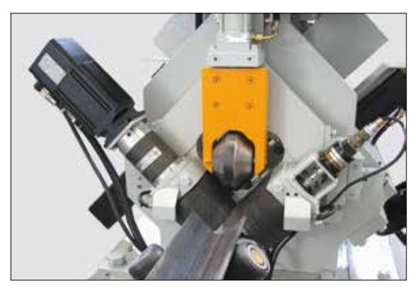
Angle infeed system with roller