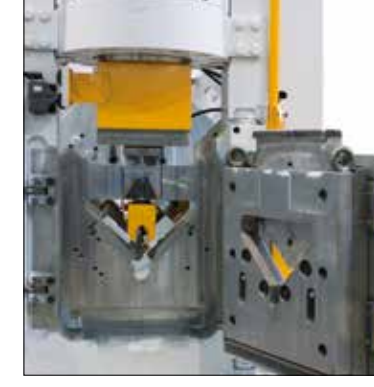
Quick-change blade holder

The Ficep CNC "A" Series angle lines are also available with a double cut shear to reduce the initial investment without sacrificing the cut quality.