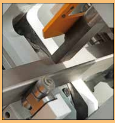
38-character rotary marking unit

Pegaso is the new generation CNC for Ficep machines. PC, CNC and PLC are all integrated on a single board to have the maximum reliability and simplicity. Pegaso is based on field bus technology: Can Bus and Ether CAT, with up to 32 axes controlled.